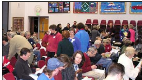
46th Dist Dems visit prior to a meeting. Our Candidate Forum and Endorsement Meetings are coming up on May 17 & June 21!

ture is made available to our PCOs for delivery to voters. And, of course, candidates who receive our endorsement often proudly list the 46th as an endorser on their campaign literature. In short, the endorsement of the 46th District Democrats matters and your participation to determine who we endorse is an important responsibility.