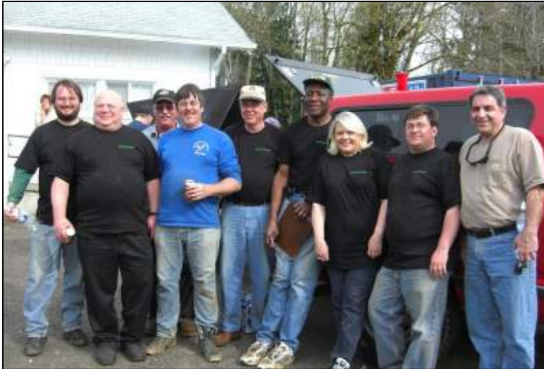
The King County Democrats were well-represented at the Lewis County—Boistfort Flood Relief Day, April 26th.